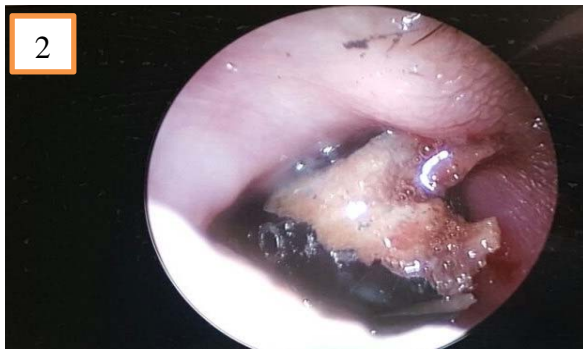
Figure 2: Endoscopic view of the left nasal cavity showed the pencil was impacted in the left nostril and nasal septum.

He was brought into the operating theatre for examination under anesthesia. Intraoperatively, the pencil was impacted firmly in the left nostril and nasal septum (Figure 2). The pencil was removed with ease using a Tilley's forceps. There was a posterior nasal septal perforation following the removal of the pencil. The embedded pencil measured 8 cm in length and 1 cm in diameter (Figure 3A). An indentation mark with part of the lacerated septal cartilage was found covering the anterior skull base. Pulsatile clear fluid from the skull base was demonstrated immediately after removal of the pencil further which confirmed the skull base fracture with CSF leak (Figure 3B). We postulated that the blunt end of the pencil served as the entry point via left nostril, penetrated the nasal septum with the extension of the injury to the anterior skull base.