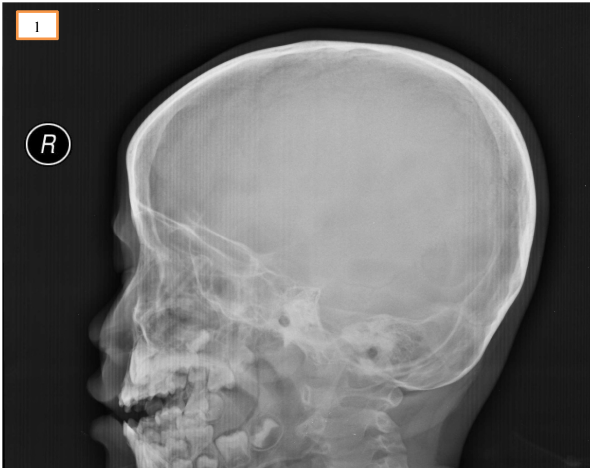
Figure 1: Radiograph of the skull showed faint pencil shadow over the left nasal cavity projecting towards the anterior skull base.

subsequently resolved. Upon review, he was hemodynamically stable, alert and conscious. Anterior rhinoscopy showed part of the pencil shaft embedded in the left nasal cavity. The child was however uncooperative for further assessment of the extent of the injury. Otherwise, there was no external wound and deformity over the craniofacial region, bilateral eye examination and neurological examinations were unremarkable. Radiograph of the skull (Figure 1) showed faint pencil shadow over the left nasal cavity projecting towards the anterior skull base.