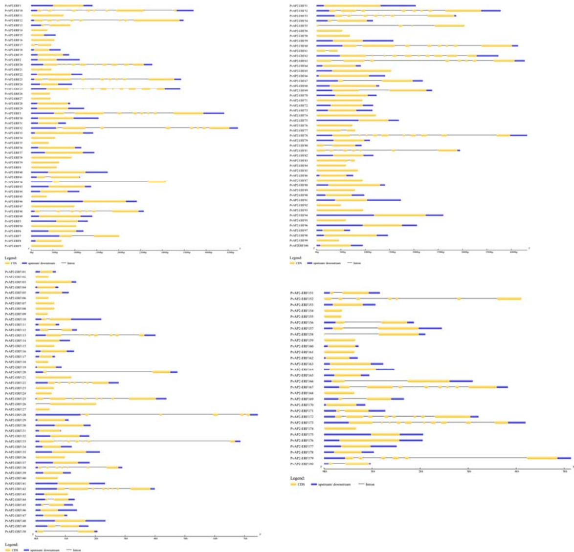
Figure S2: Structural analysis of 180 PvAP2-ERF genes drawn by the Gene Structure Display Server (GSDS). CDSs are represented by yellow boxes while blue ones indicate upstream and downstream region. Black lines represent introns.