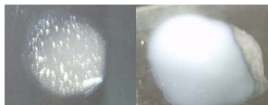
Figure 1: Coagulase test for Staphylococci . Control test (left) showing clumping when Staphylococcus aureus suspension reacted with human plasma while the reaction test (right) with coagulase negative Staphylococci showing no clumping

The PCR based detection of different antimicrobial resistance genes showed the presence of aacA-aphD gene in 3 isolates (23 %), erm(A) gene fragment in 3 isolates (23 %), tetK gene fragment (360 bp) in 4 isolates (30.7 %) and tetM in 6 (46.1 %) isolates. The blaZ gene which confers resistance to penicillin was detected in 3 isolates (23 %). No amplification was observed with primer sets used for genes reported to confer resistance against vancomycin. In the duplex PCR for MeccA and mecA , responsible for conferring resistance to methicillin, the MeccA was amplified in 3 isolates (23 %) and mecA was amplified in 2 isolates (15.3 %) while in 3 phenotypically resistant isolates, no gene was detected for methicillin resistance. The gene fragment of bla TEM-1 was amplified (962 bp) in 3 isolates (23 %) while the gene aac(6')/aph(2'') responsible to confer resistance to gentamicin was found (1184 bp) in 4 isolates (30.7 %). The representative amplified products are shown in Figure 3.