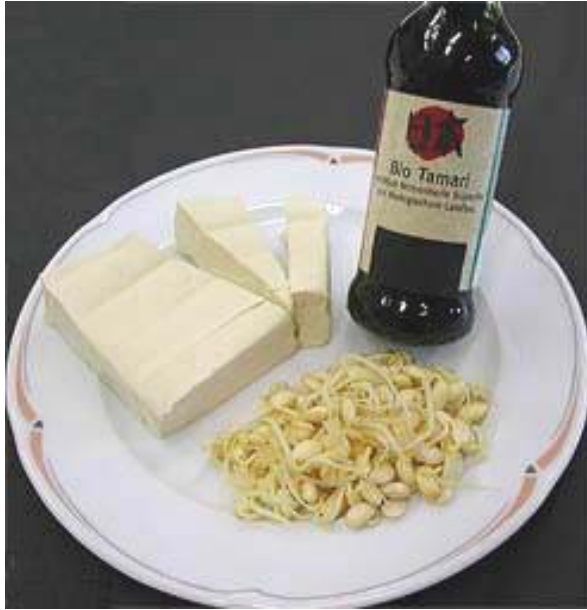
Fig. 1: Soy products: as a rich source of isoflavones soy has been reported to reduce coronary heart disease and cancer risk in exposed adults. However, some recent studies provide evidence that transplacental exposure of embryos to isoflavones may contribute to infant leukemia.

The “classical” topoisomerase II targeting substances act by trapping the cleaved G-strand-enzyme intermediate, thus, blocking religation and enzyme release, leaving the DNA with a permanent double strand break. These substances that lead to higher levels of covalent topoisomerase II-DNA complexes have been termed topoisomerase II-“poisons”, whereas substances that inhibit the enzyme during other steps are referred to as “catalytic inhibitors” (Walker and Nitiss, 2002). The best known topoisomerase II-poisons belong to two classes of antineoplastic agents, the epipodophyllotoxins (e.g. etoposide and teniposide) and the anthracyclines (e.g. doxorubicin). Catalytic inhibitors include for instance derivatives of coumarin antibiotics, such as the coumermycins and novobiocin, the thiobarbiturate merbarone and the bisdioxopiperazines (Walker and Nitiss, 2002). However, besides the mentioned drugs there is a relatively large number of natural and synthetic products present in environment and food that act as topoisomerase II-poisons and/or catalytic inhibitors ( Table 1 ).